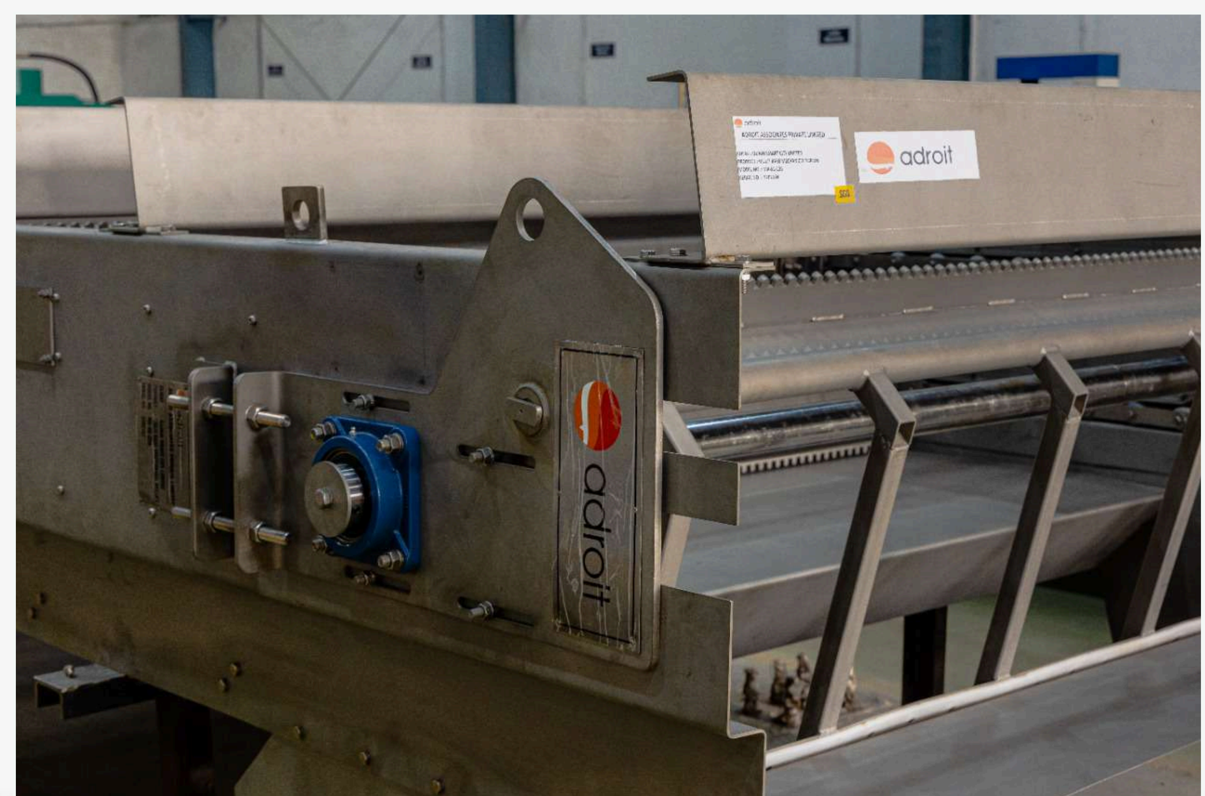
Manufactured Mechanical Screens at our factory