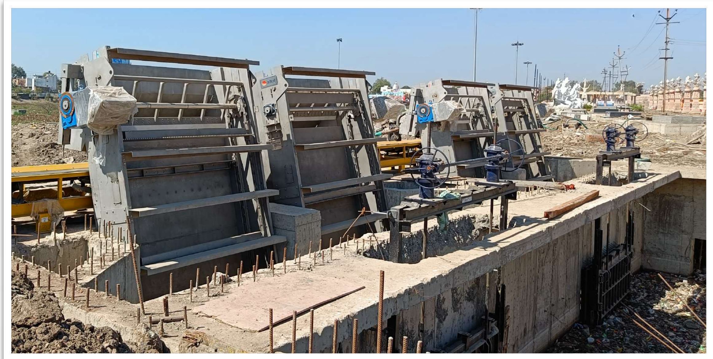
Our installation of 4 Multi-rake Mechanical Screens, 5 Sluice Gates and Conveying System at storm discharge outlet at Rudra Sagar Lake

Ujjain District is the first largest city in Madhya Pradesh, India located at the Banks of the Shipra River. Ujjain is an ancient and historical city that is 5000 old. The famous Temple, Mahakaleshwar Jyotirlinga (Mahakal or Shiva temple) is located at the center of the city. The Mahakal Temple is one of the 12 Jyotirlingas in the country and attracts annual tourist footfall of 15-20mn. The Mahakal Temple also registers a massive footfall during the Simhasth Kumbh here which takes place every 12 years. The Kumbh in Ujjain was last held in 2016.