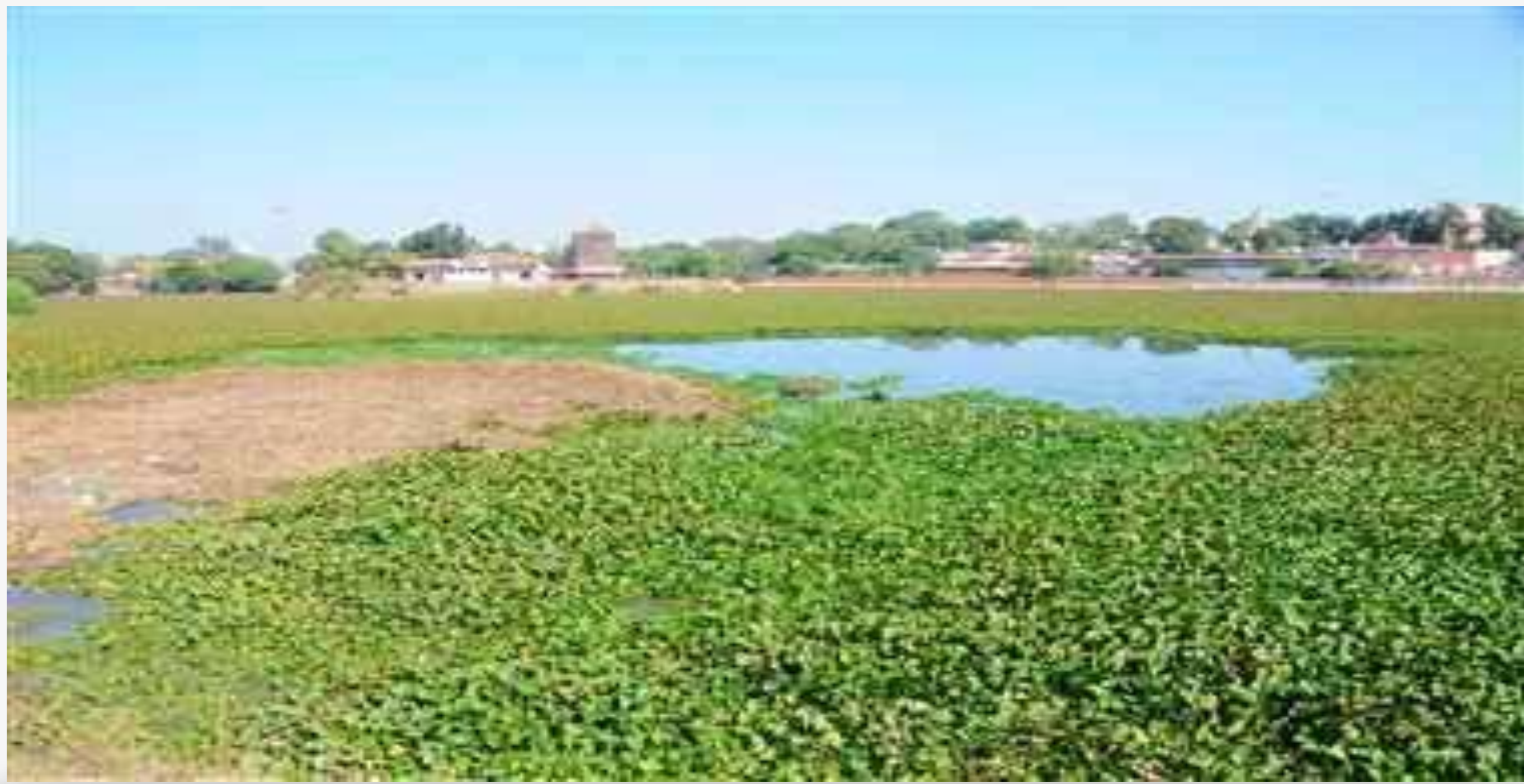
Rudra Sagar Lake before execution of Mahakal Corridor Project

Rakeflow™ Multi-rake Screen is key technological equipment in rejuvenating the Rudra Sagar Lake and adding to the beauty of the magnificent Mahakal Lok corridor. The screening system prevents any floating waste including plastics, plants or any large waste to enter the lake. All the screened waste is taken out through a conveyor. Allowing fresh clean storm water inside Rudrasagar. Mahakal corridor is now ready to welcome all devotees.