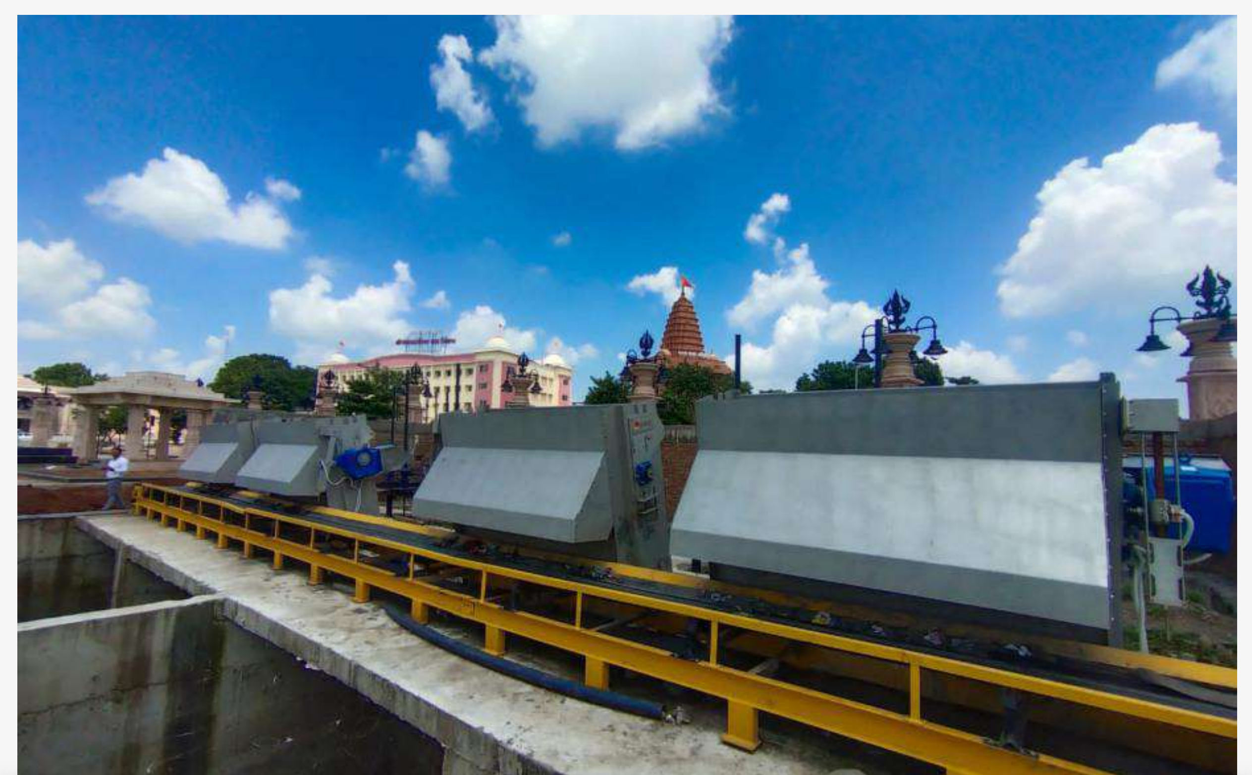
Mechanical Screen & other equipment installation at Rudra Sagar, Ujjain