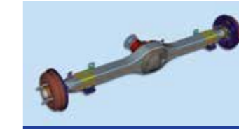
Aggregates - Axle, Gearbox and Clutch