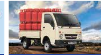
Built for Any Load / Any Road