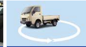
WB - 2100 mm and TCR - 4.3 m