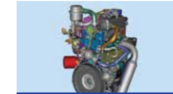
702cc 2-cylinder IDI Engine