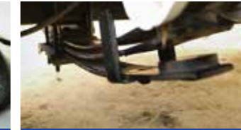
Front & Rear Leaf Spring Suspension